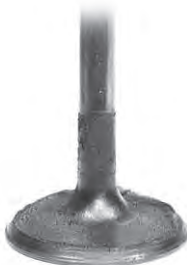
Intake Valve after P.i. Treatment