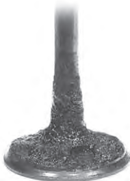
Intake Valve before P.i. Treatment