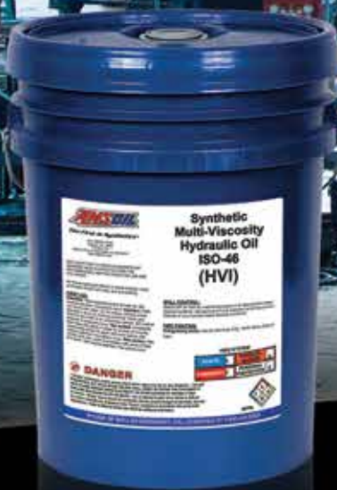
SYNTHETIC HYDRAULIC OIL