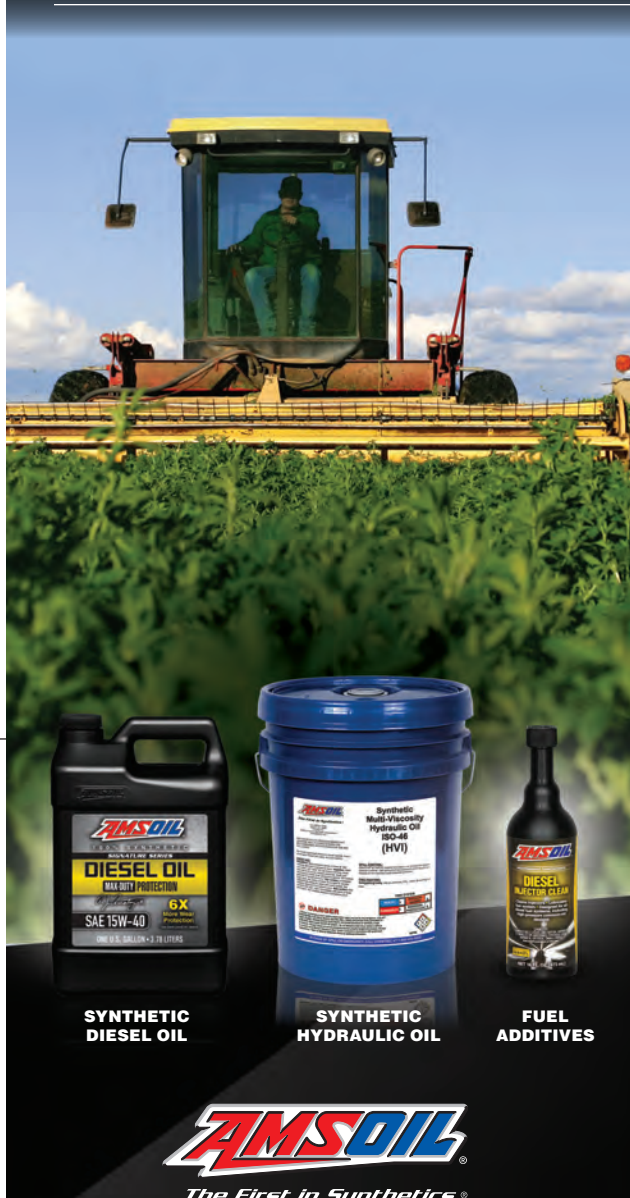
SYNTHETIC DIESEL OIL