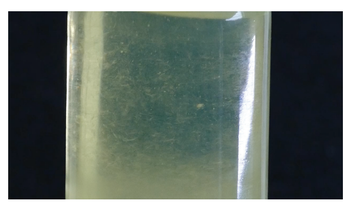
Wax crystals in untreated diesel fuel. The wax crystals will eventually fall out of solution and plug the fuel filter.